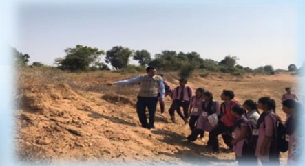
Peoples' Biodiversity Register

Register Yourself on... https://forms.gle/VNg6T7MjNYGgbf1L7