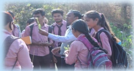
Peoples' Biodiversity Register